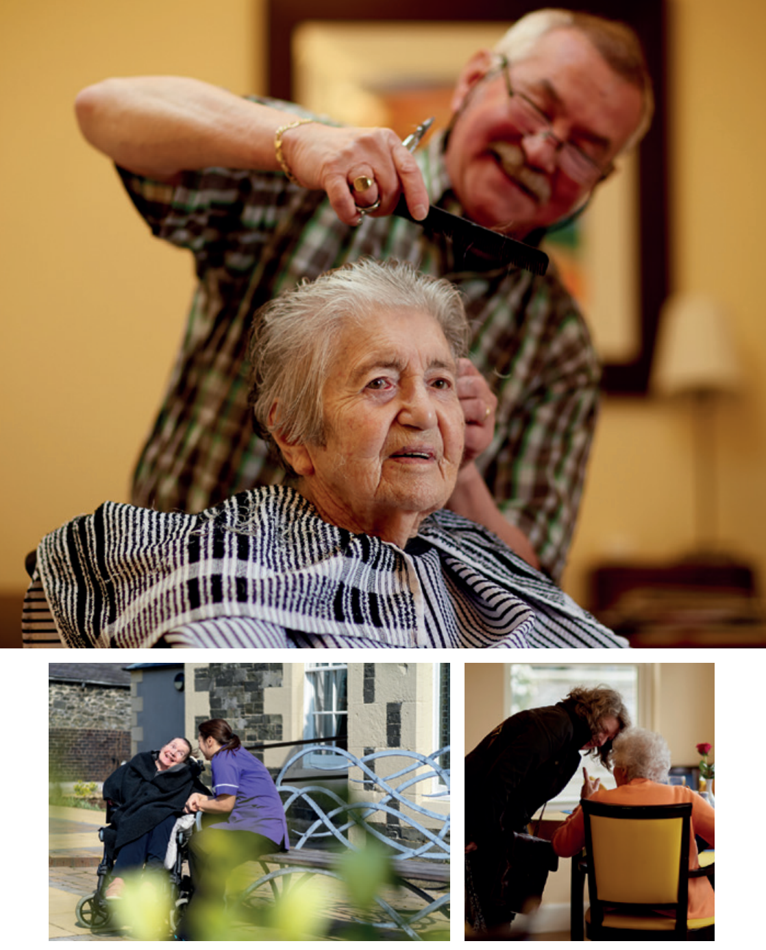
Mansfield Care Group homes wouldn't be the special places they are without our wonderful staff, our residents, and their family and friends.