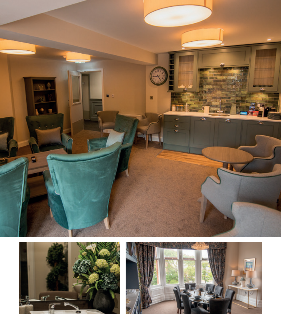
A friendly, relaxing home with excellent facilities including private dining room, coffee room and hairdressers.