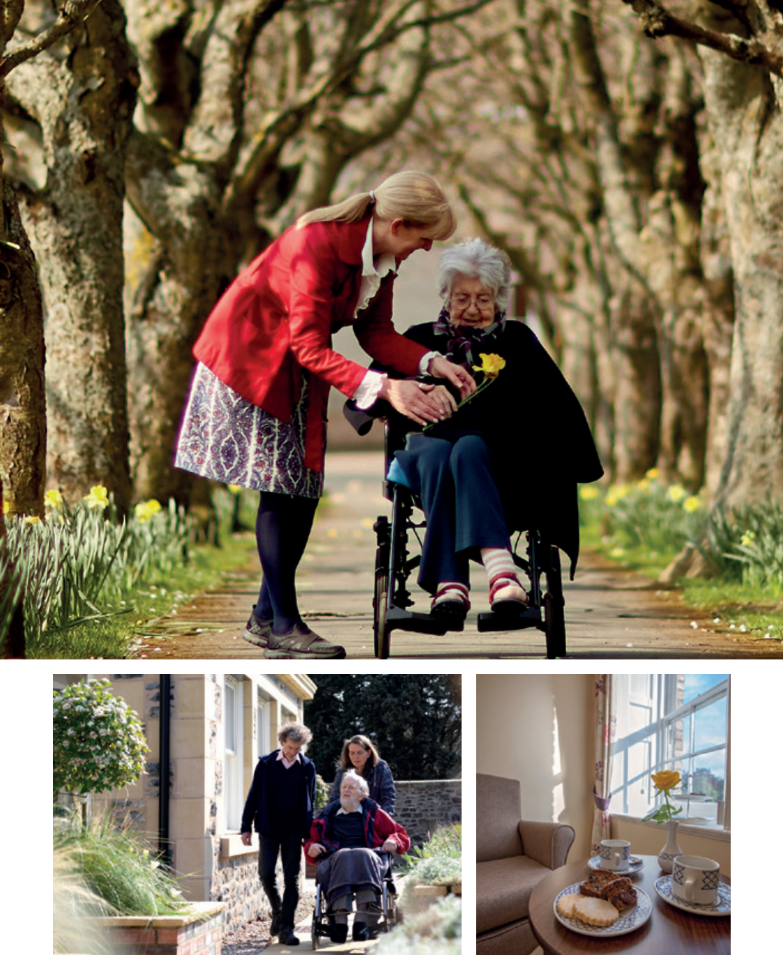
Every resident is a unique individual, and each of our homes has a different character, so you need to experience it for yourself.