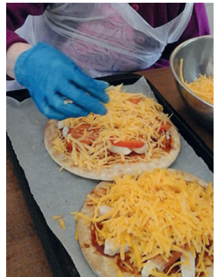
Argyll House is an exceptionally warm and welcoming home in a quiet residential area.