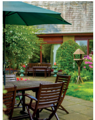
Belleville Lodge is an exceptionally calm and tranquil home in the heart of the city.