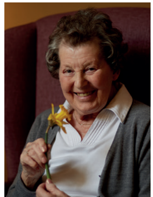
Craighall House is a home with good community links and a lively and vibrant atmosphere.