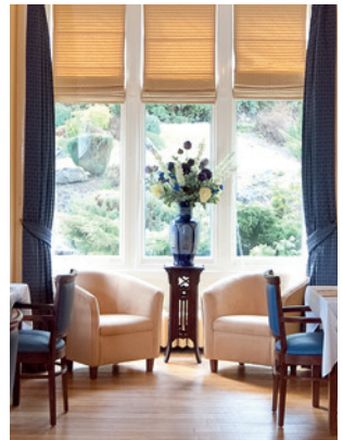
Galahill House is set in secluded, mature gardens close to Galashiels town centre.