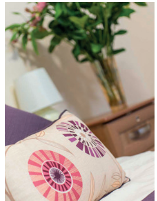
Millfield House is situated overlooking Mary Queen of Scots House.