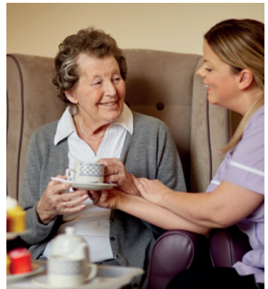
A shared lunch in the dining room or afternoon tea in the lounge gives residents and staff time to chat.